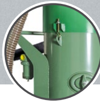
CONTRACOR Z-200 BLAST POT

mounted directly on the Contracor Z-200 series blast pot.